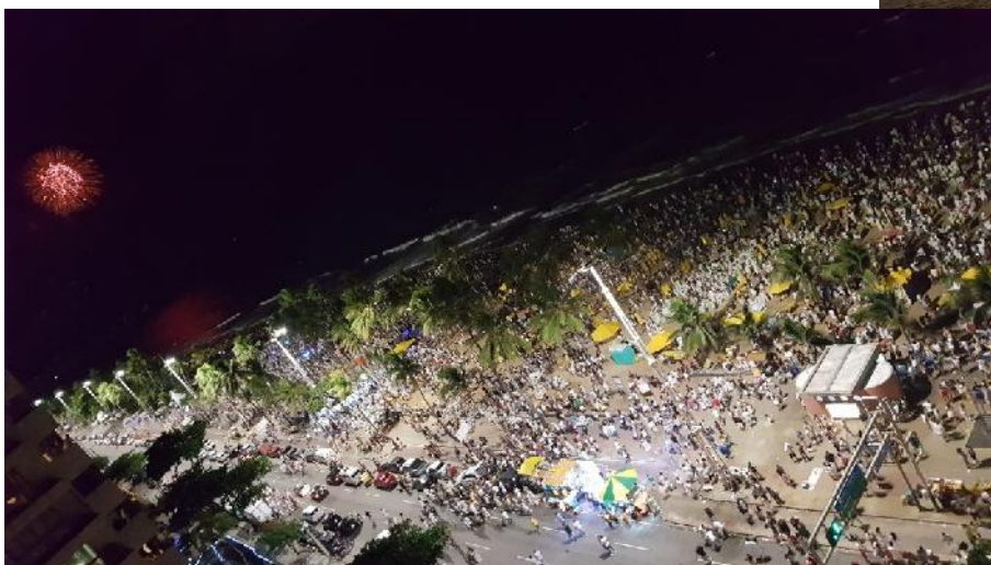
New Year in Recife